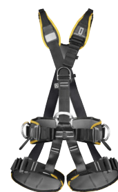
PROFI WORKER III