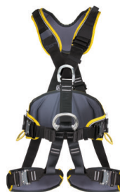
PROFI WORKER 3D STANDARD