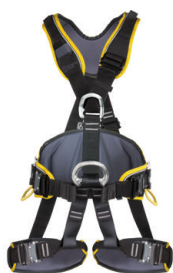
PROFI WORKER 3D SPEED