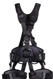
PROFI WORKER 3D SPEED black