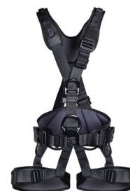
PROFI WORKER 3D STANDARD black