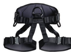
SIT WORKER 3D SPEED black