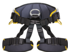
SIT WORKER 3D STANDARD