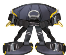
SIT WORKER 3D SPEED