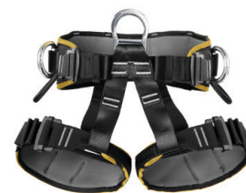
SIT WORKER III