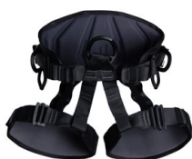
SIT WORKER 3D STANDARD black