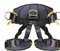
SIT WORKER 3D SPEED STEEL