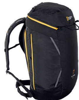
ROCKING 40 C0086BX40