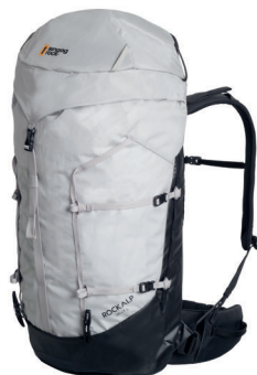
ROCKALP 35+7 C0097W357